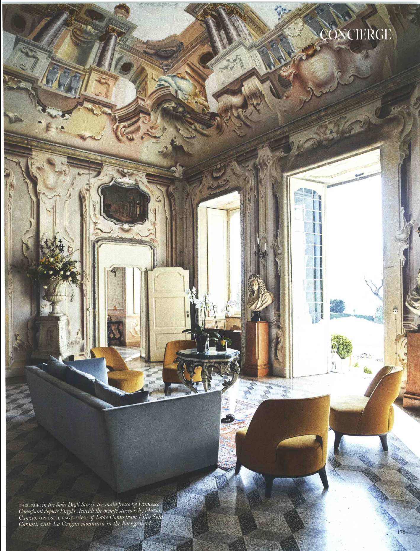
THIS PAGE: in the Sala Degli Stucci, the main fresco by Francesco Conegiani depicts Virgil's Aeneid; the ornate stucco is by Murzio Canzio. OPPOSITE PAGE: view of Lake Como from Villa Soldati, with La Grigna mountain in the background.